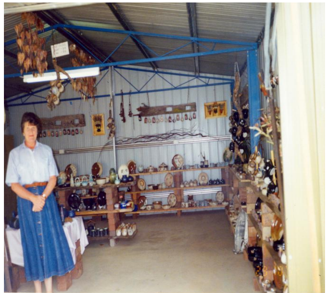
Mindethana Pottery Gallery