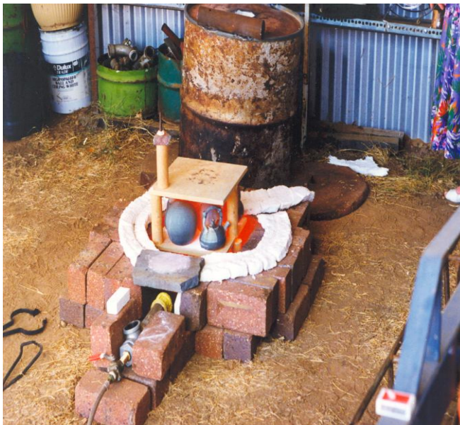
Raku Firing - Fired to near 1000°C