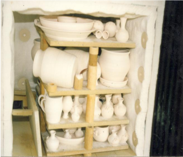
Kiln packed - Fired 1280 ° C