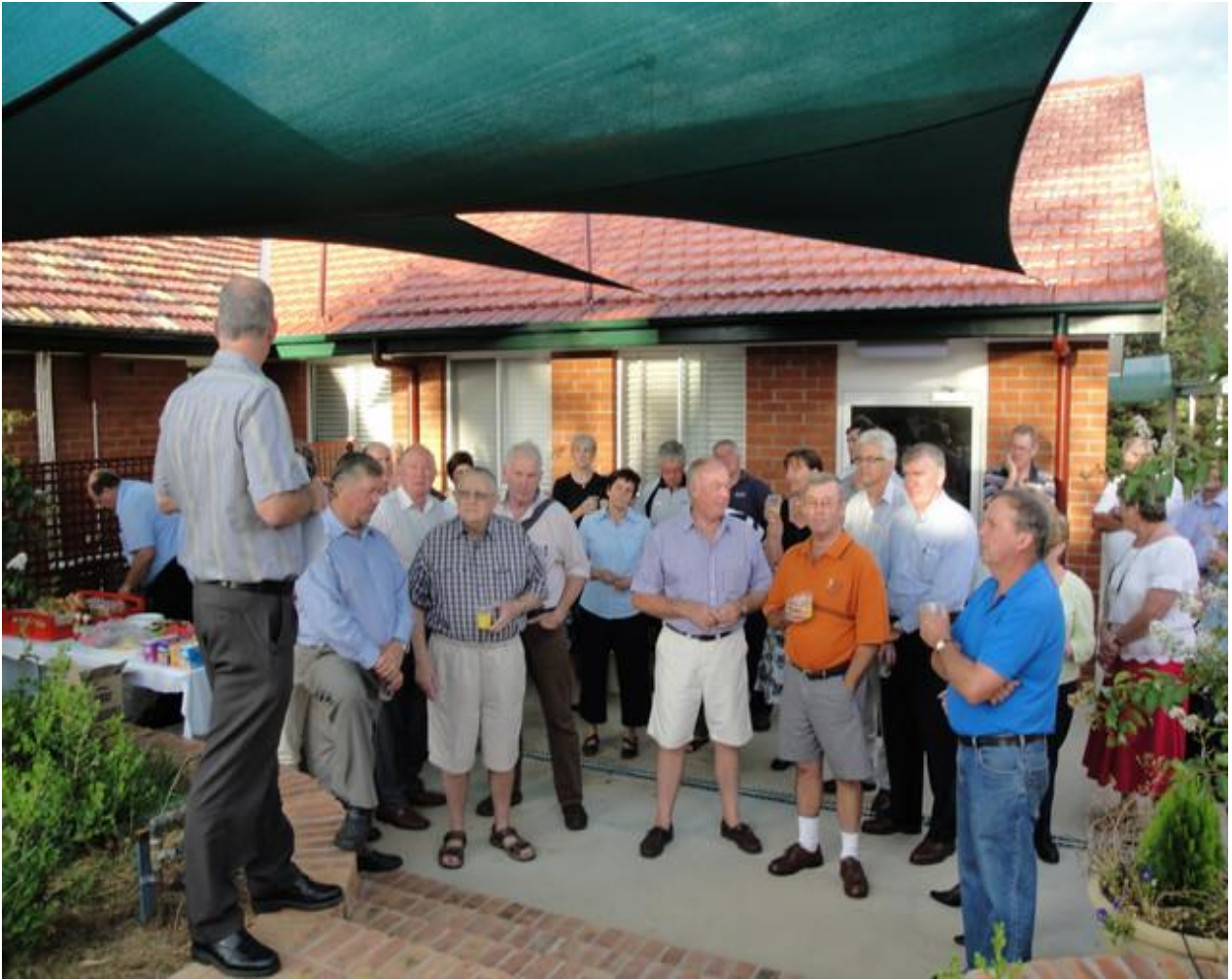
03.02.2010 – Our visit and tour of the Oncology Unit