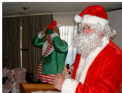
Santa with his favourite Elf