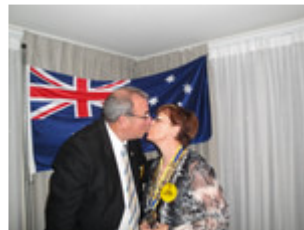
Passing over the chain of office with a kiss