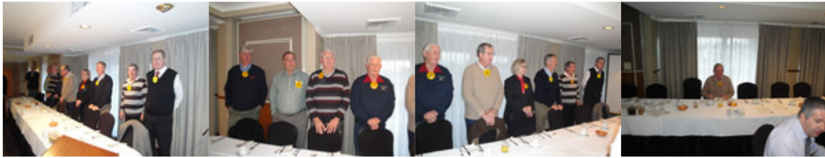
Past Presidents table