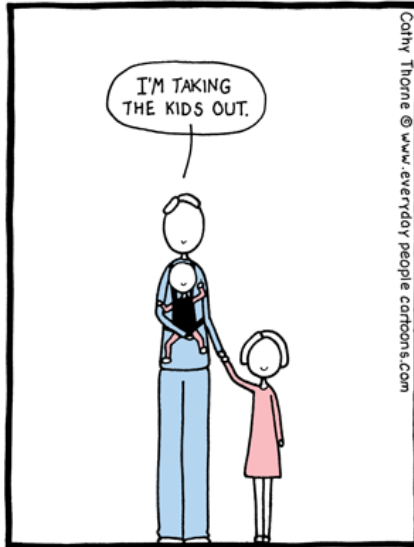
THE SEXIEST MAN ALIVE!