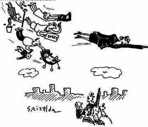
"Look! It's superwoman...and all her assistants!"

© Original Artist Reproduction rights obtainable from www.CartoonStock.com