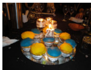
Cup cakes to celebrate