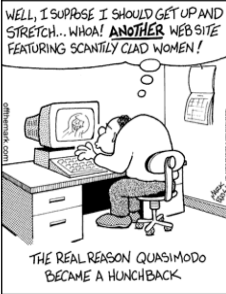
THE REAL REASON QUASIMODO BECAME A HUNCHBACK