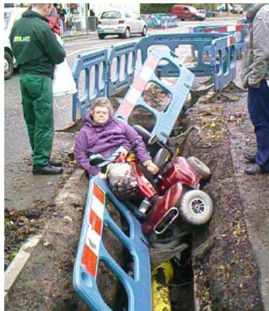
Roadworks at Kootingal – gopher looks familiar