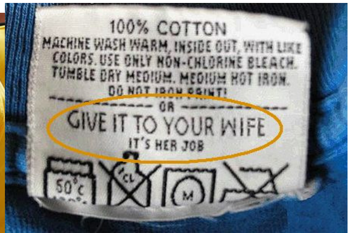
Found this on one of my jumpers