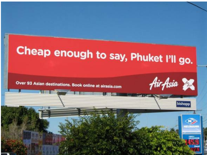
At Brisbane Airport