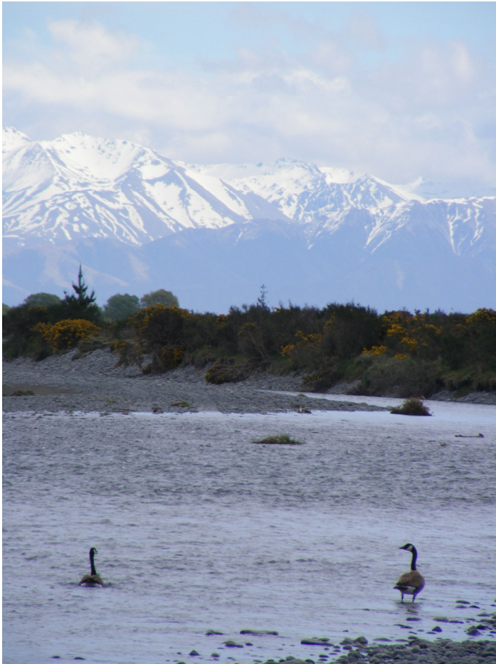
Yes I was working