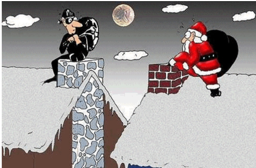
Could be Tamworth at the moment