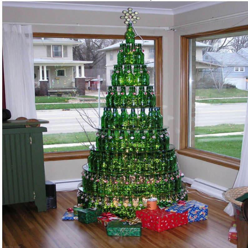
Red neck Christmas Tree