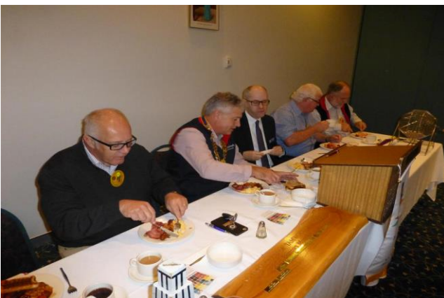
President and guest speaker enjoying breakfast