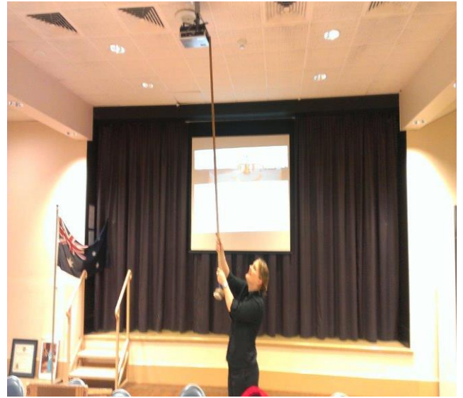
Our new venue – Wests Diggers – showing modern equipment for our use – Leesa with her broom stick