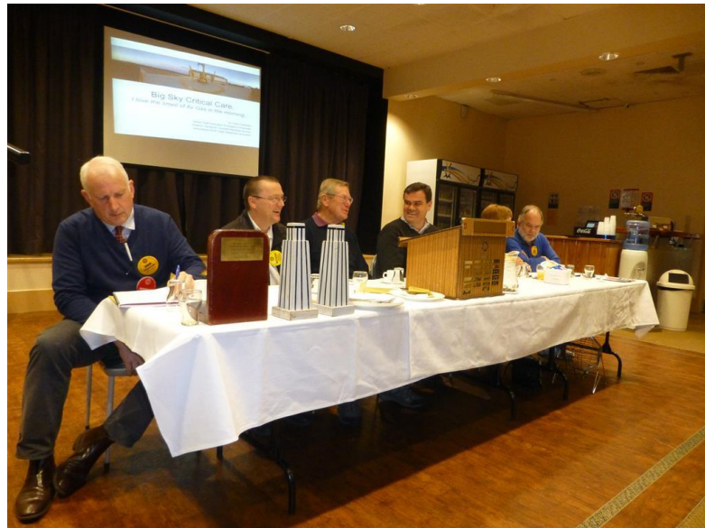
The head table at our new venue