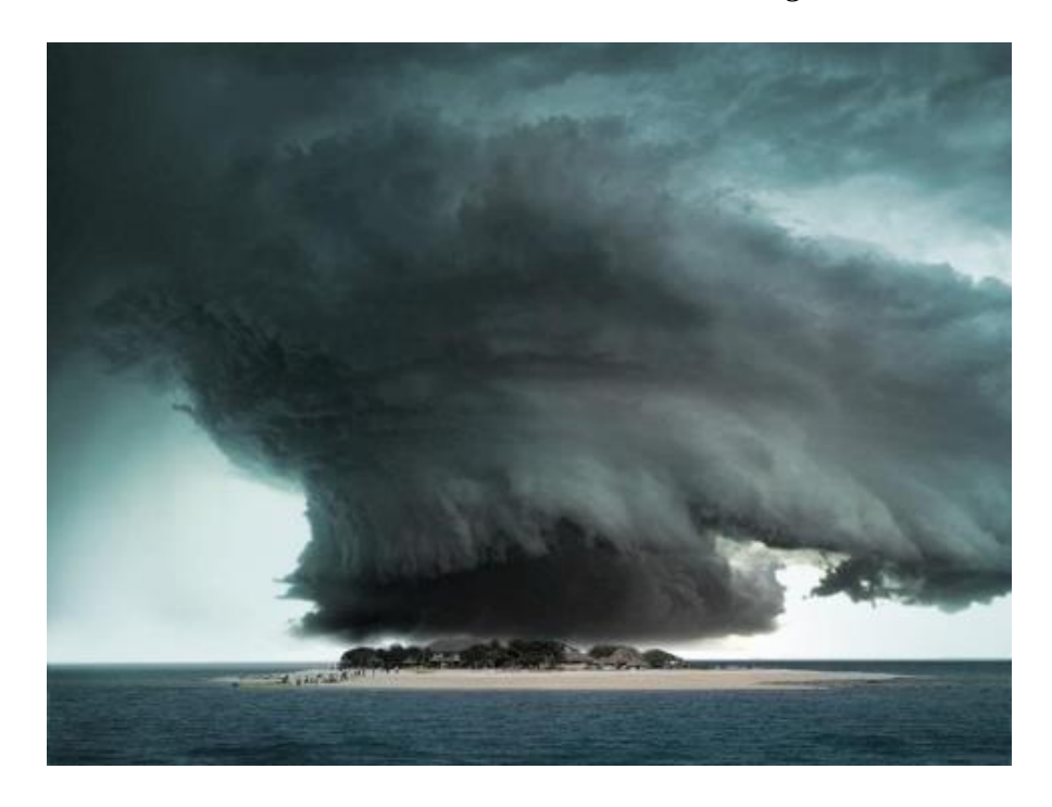
Just a couple of amazing photos for the Bulletin this week

Both they and their businesses were winners at The Tamworth Business Awards last night