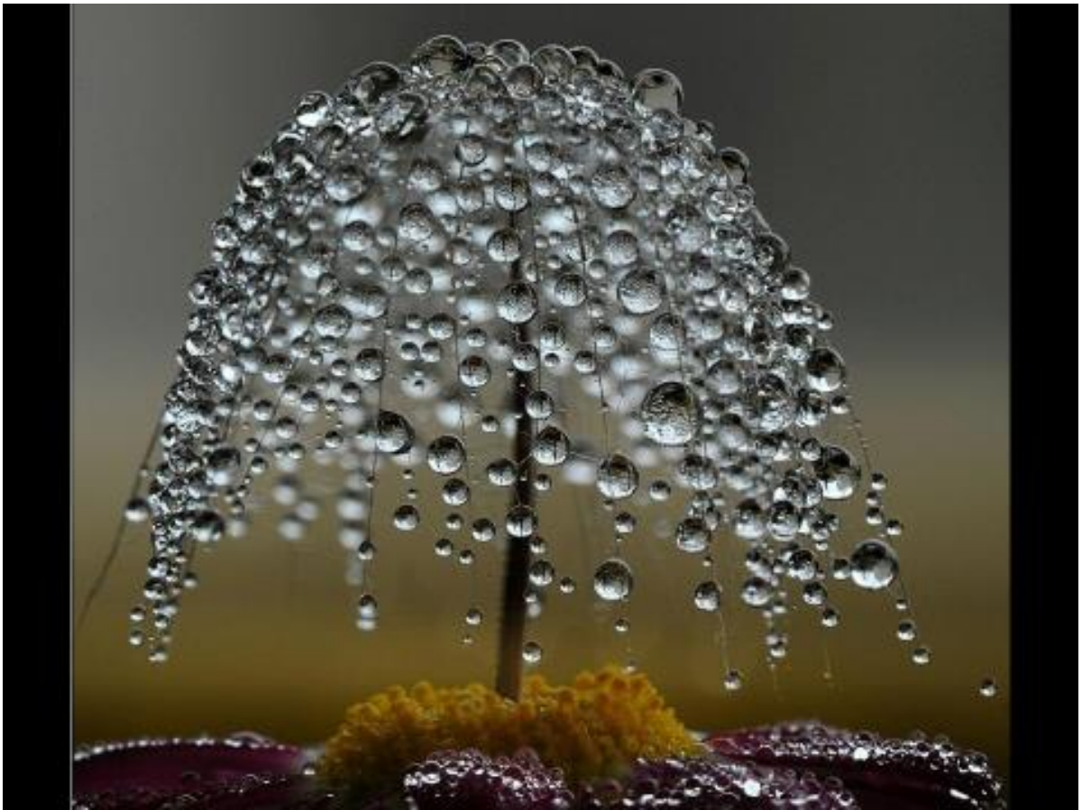
Just some amazing photography to enjoy