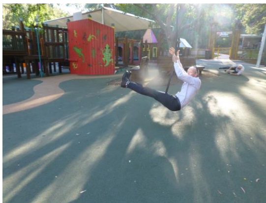
There is still a child in all of us!