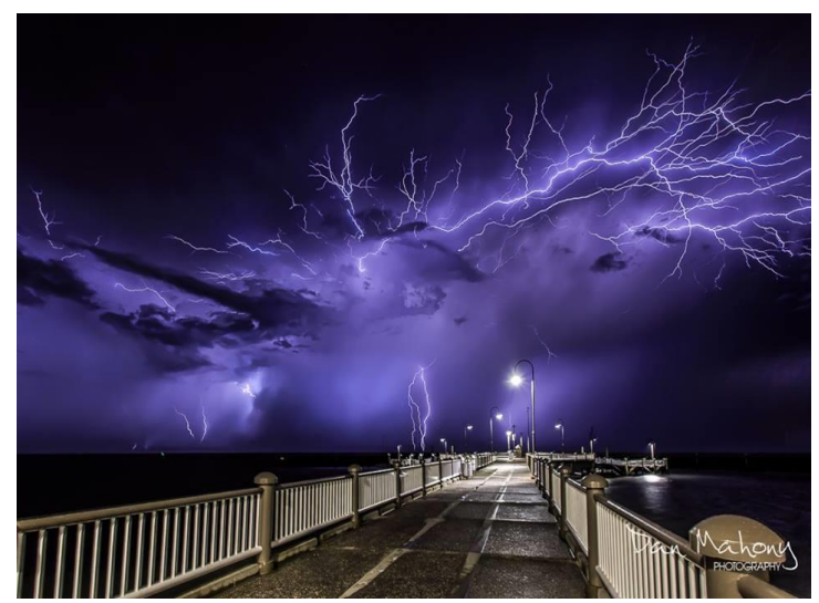
What amazing patience one must have to be a great photographer – could not resist including these shots.