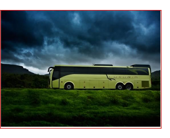
BELIEVE IT OR NOT - IT IS OLIVEA