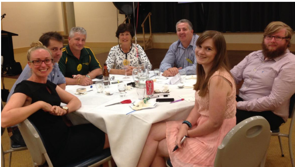
Other happy participating tables – plus our guest speaker – the young man with the beard – with a serious scientific topic which had some humour as well