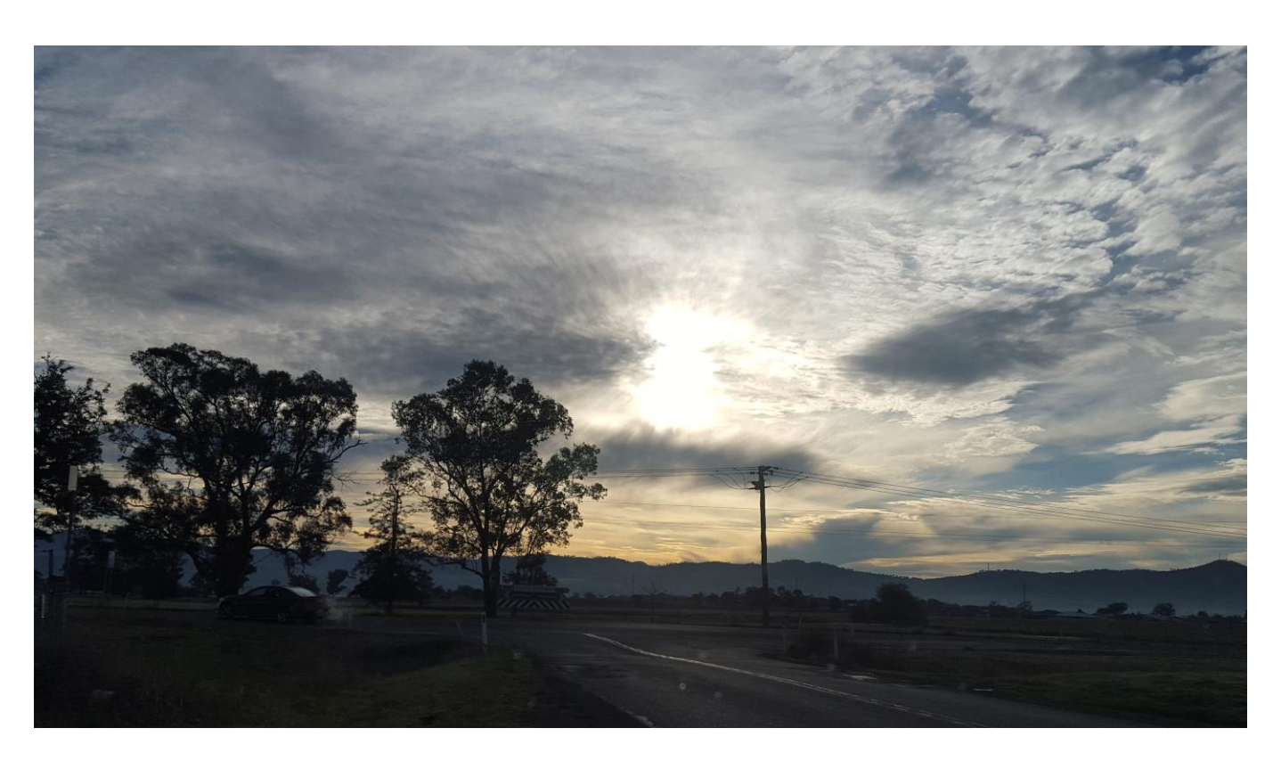
First light over the hills of Tamworth!

Treasurer : PDG Jane Bradford 0429 666 100