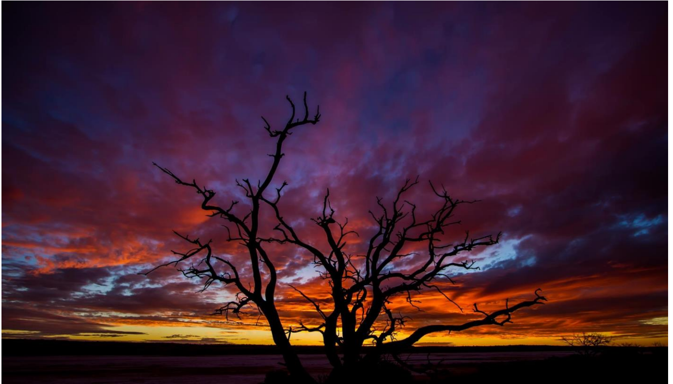
Too good not to share. A beautiful sunset from a Simpson Desert adventure in 2014. Taken at sunset overlooking a clay-pan. Thanks Garnet Wood.