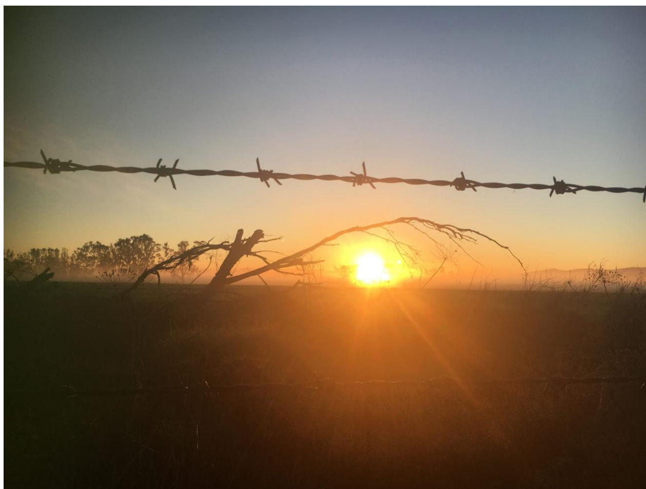
sunrise at Boggabri!