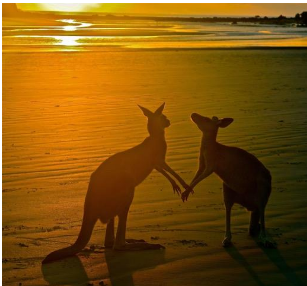
Cape Hillsborough National Park, Qld

Treasurer: PDG Jane Bradford 0429 666 100