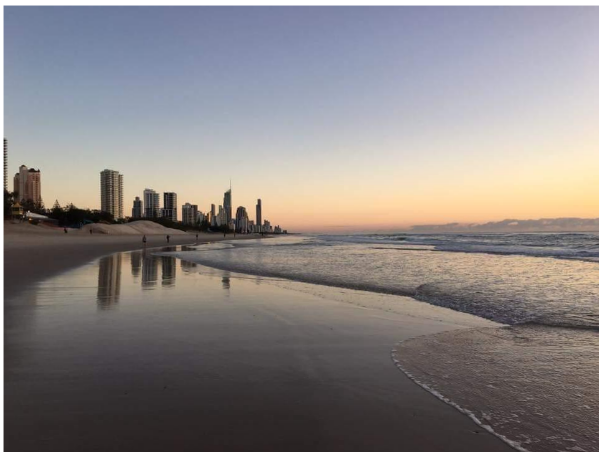
(good to see our gofers starting their days right with a walk on the beach!)

Treasurer: PDG Jane Bradford 0429 666 100