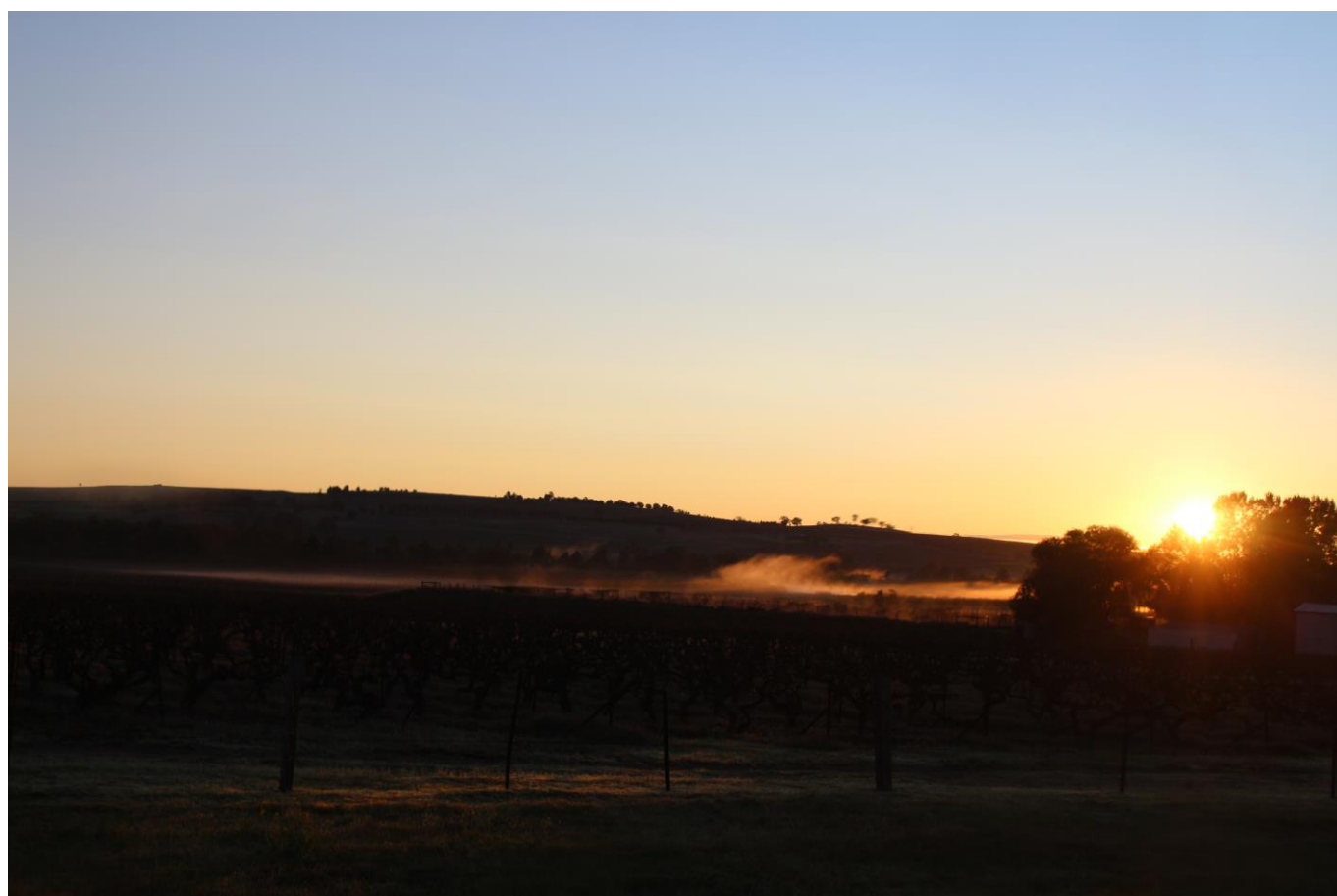
(sunrise air balloon trip, Hunter Valley)

Treasurer: PDG Jane Bradford 0429 666 100