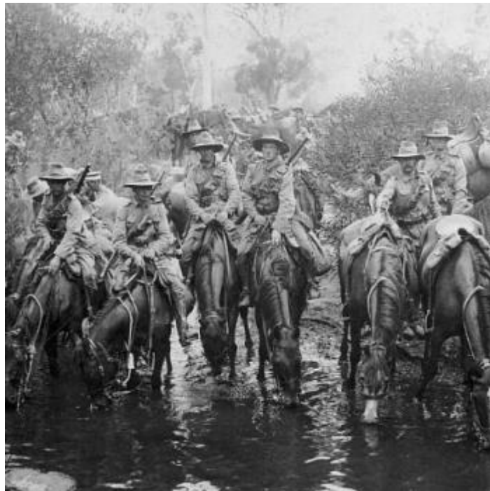
Honouring the ANZACS at Beersheba