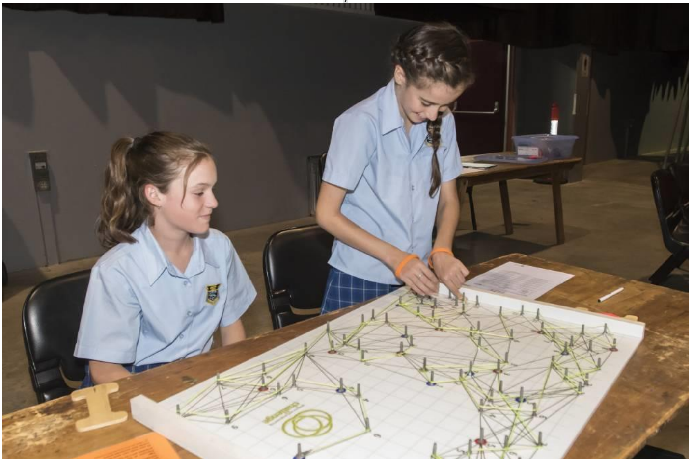
Science and Engineering at TREC