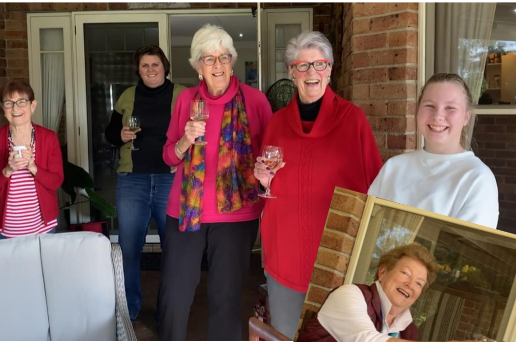
Collage of photos on a lovely Sunday afternoon at end of June 2020