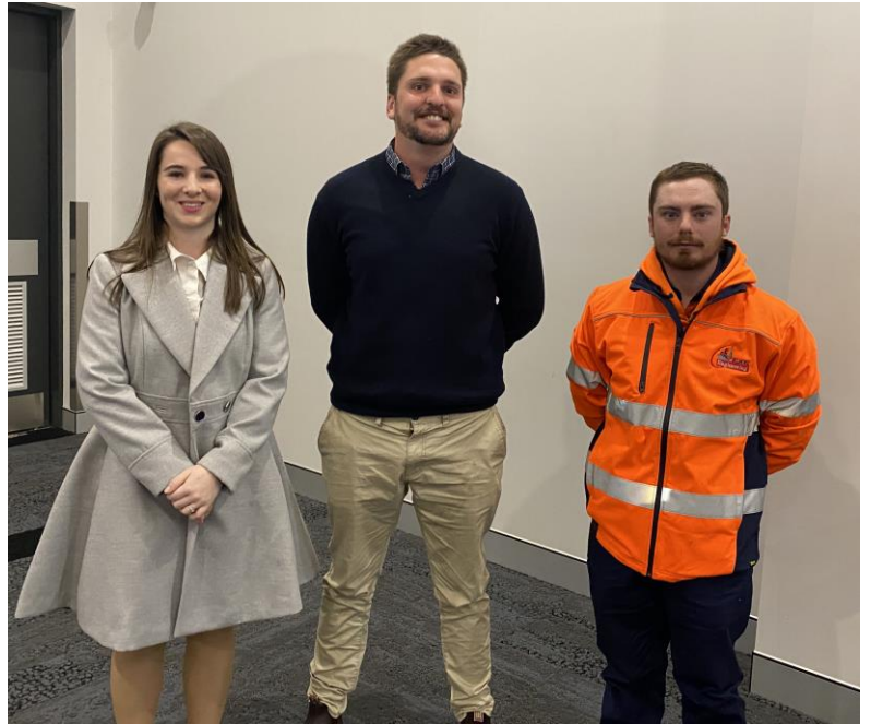
Our RYLarians for 2020