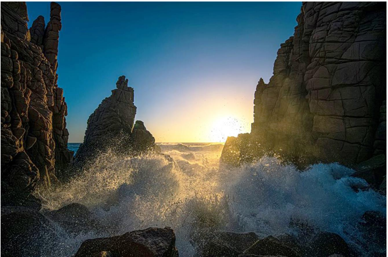
Wave Burst at Sunrise