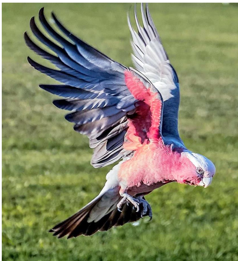
Galah preparing to land - David Hinwood