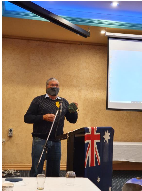
Auctioned, limited edition handmade face mask