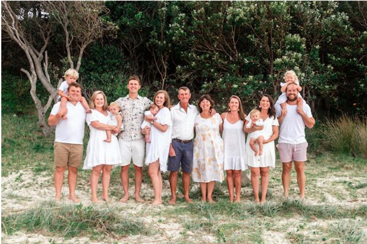
The Penman Clan