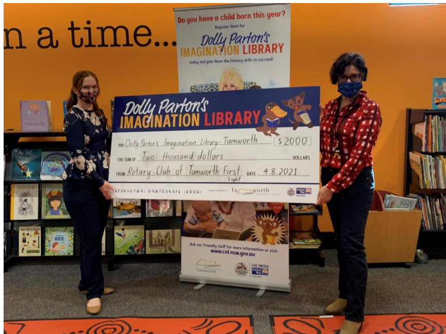
Recognition of our $2,000 donation from 2020/ 2021