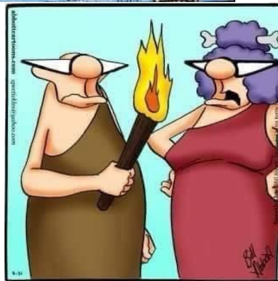
"Whoop-de-do, you discovered fire. Don't expect me to start cooking."