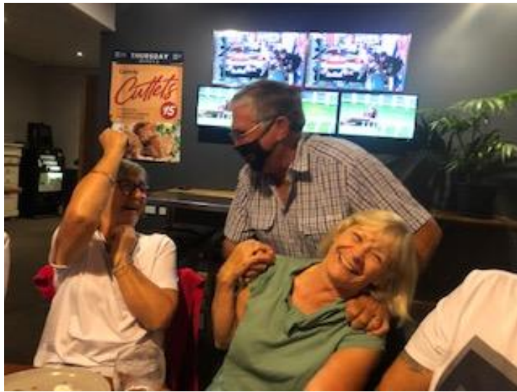
Christmas fun starting early this year