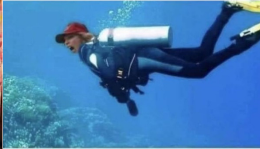
Anti-Masker Drowns After Trying Out SCUBA Diving