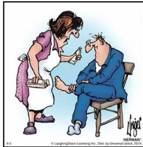
“You getting athlete's foot is about as ridiculous as a coal miner with sunstroke!”