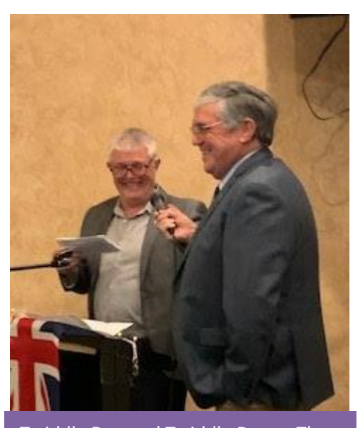
Twiddle Dee and Twiddle Dum – The Fine Sergeants. And you all thought my dad jokes were bad!