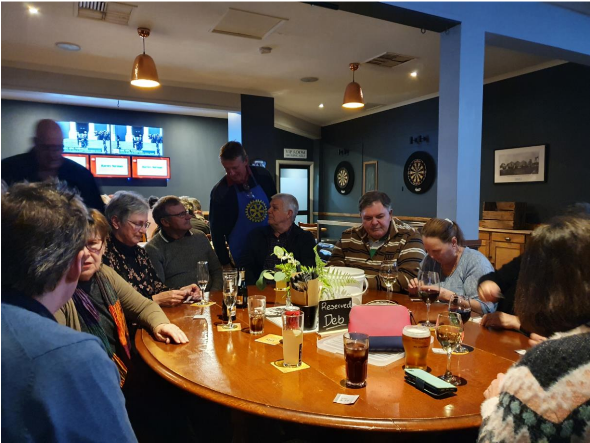
Friday social at the PO