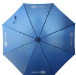
Rotary Large Umbrella

Other items such as hats, umbrellas, generic Rotary shirts, golf balls and many more can be purchased from Rotary Down Under (RDU) Supplies: https://rdusupplies.com.au/