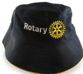
Rotary Bucket Hat