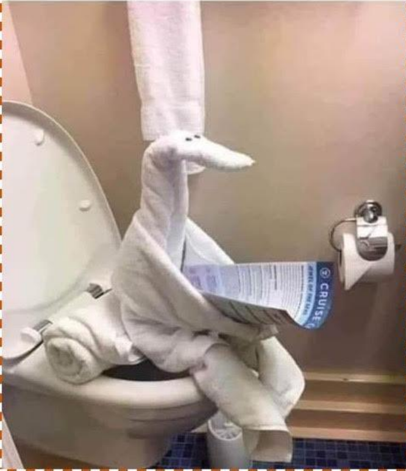
Towel animal left by the hotel staff