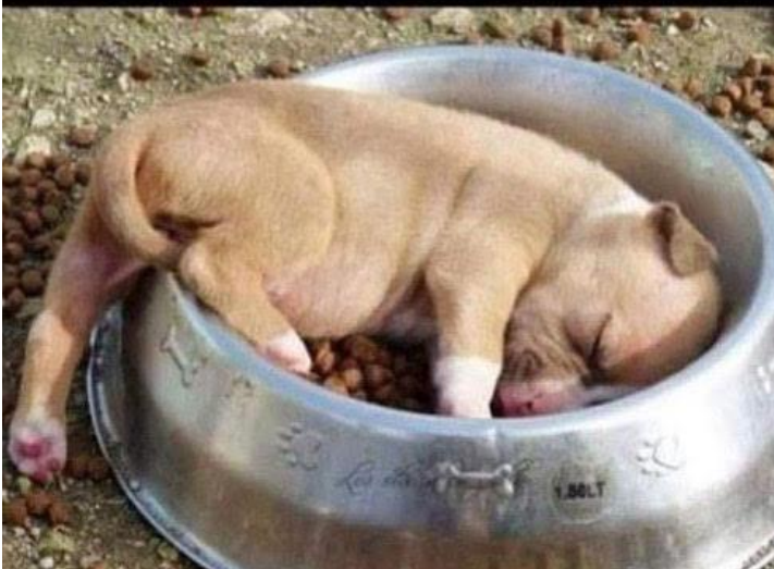
Bed and Breakfast