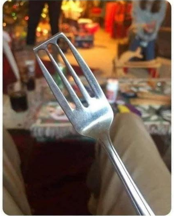
The diet fork