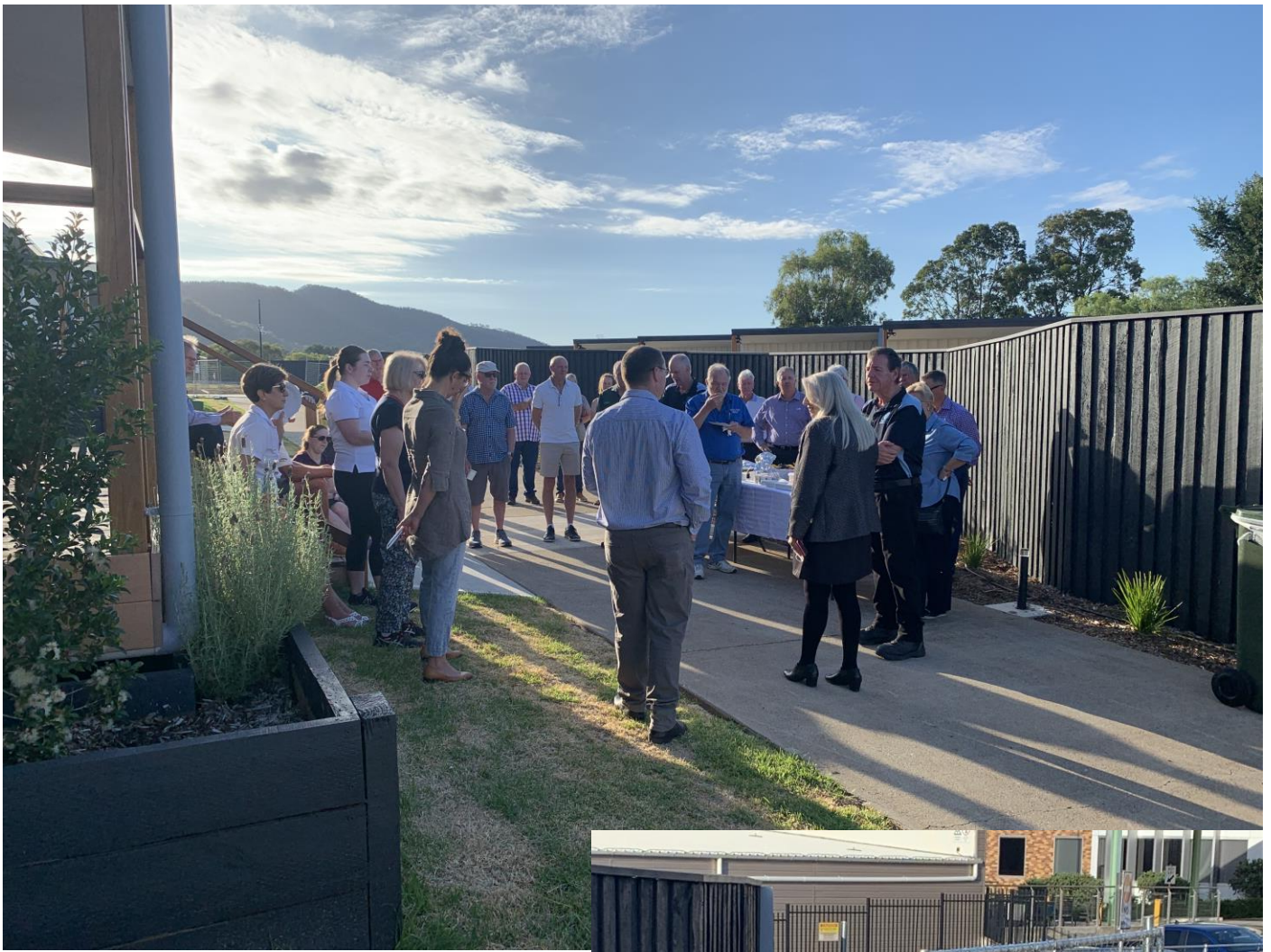
Rotary Lodge photos