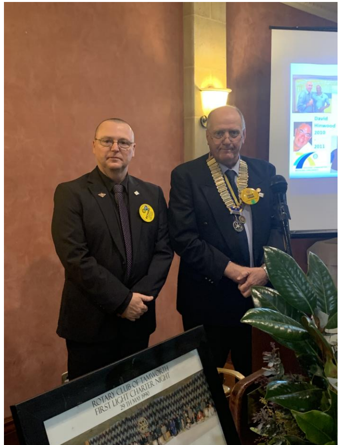
Everyone is so happy