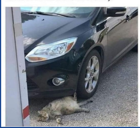
My friend's cat is out here trying to collect some insurance money.