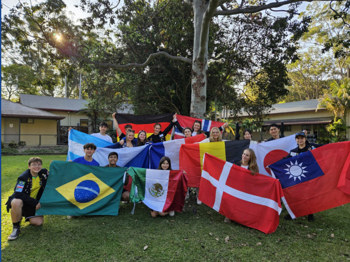
Inbound Camp weekend for the girls