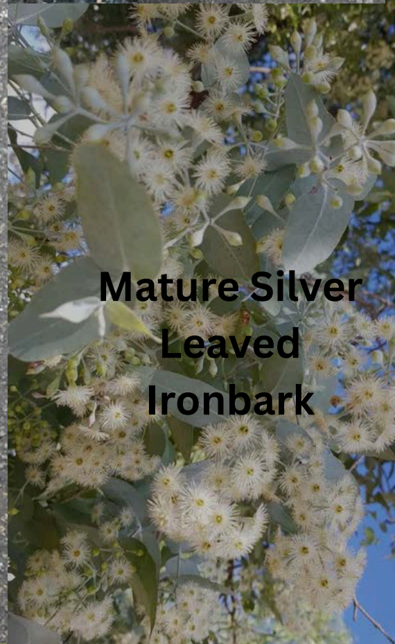
Mature Silver Leaved Ironbark