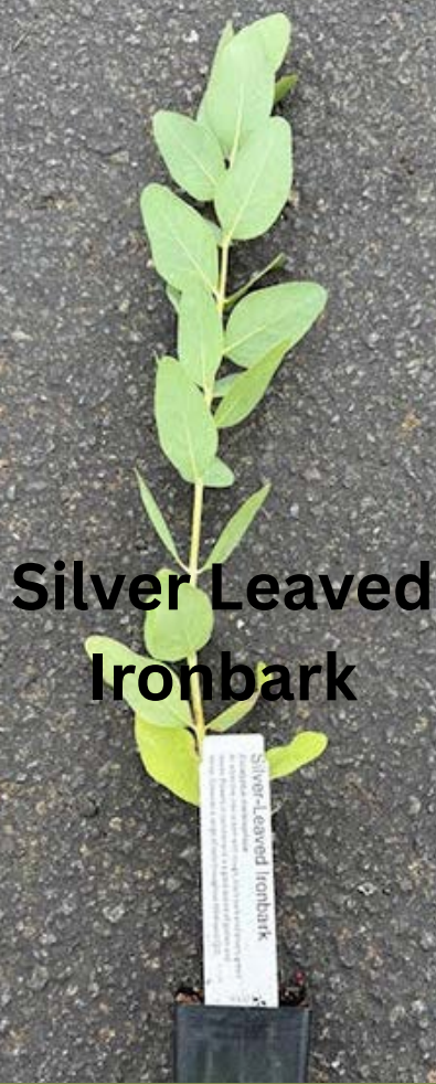
Silver Leaved Ironbark